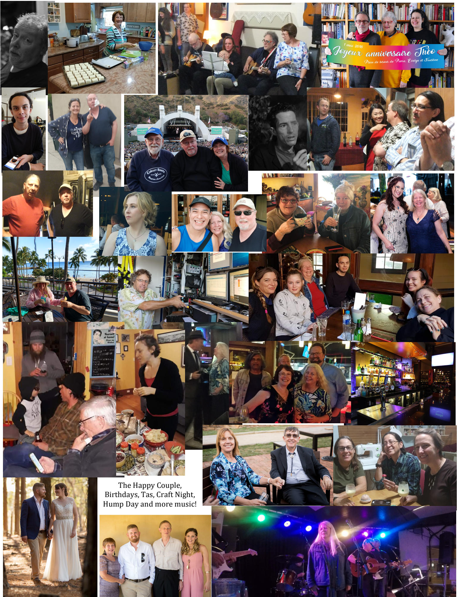
The Happy Couple, Birthdays, Tas, Craft Night, Hump Day and more music!