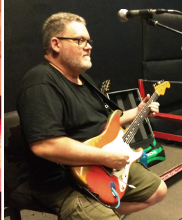
FZ was right. MUSIC IS THE BEST!